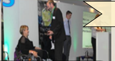
Several Fair Play Supporters Awards