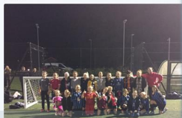
SUPPORTING INTERNATIONAL WOMEN'S DAY