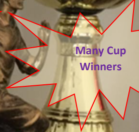
Many Cup Winners