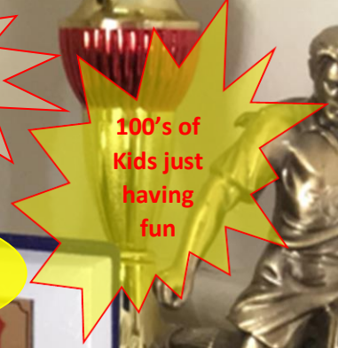
100's of Kids just having fun