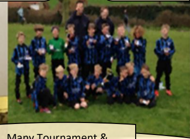
Many Tournament & Festival Winners