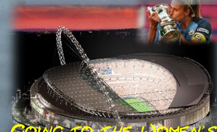
GOING TO THE WOMEN'S FA CUP FINAL