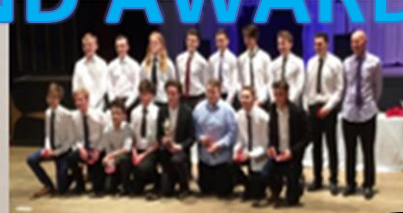
NSPCC Child National Welfare Officer award