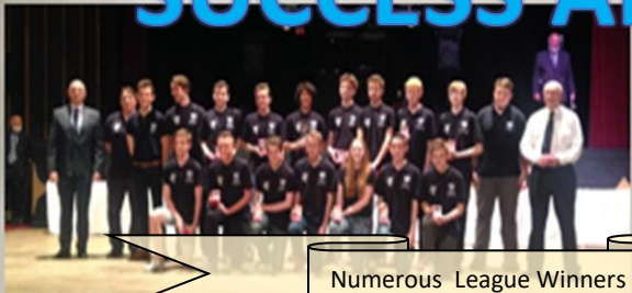
Numerous League Winners