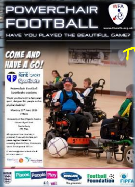
TV AUDIENCE PARTICIPATION AND MEETING THE STARS FOR OUR ADULT PLAYERS