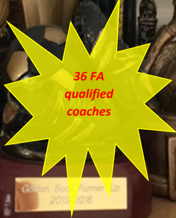
36 FA qualified coaches