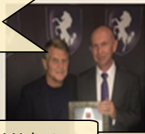
Kent FA Volunteer of the Year