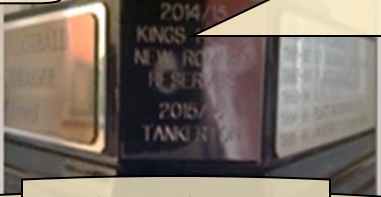
Fair Play Award Winners