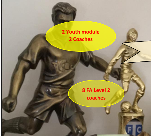
2 Youth module 2 Coaches