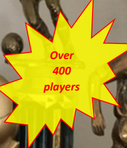
Over 400 players