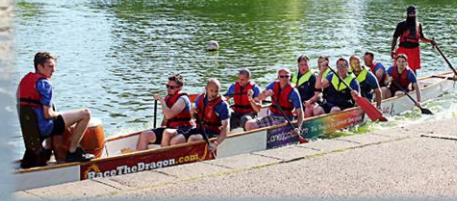
DRAGON BOAT RACING IN MAIDSTONE FOR CHARITY