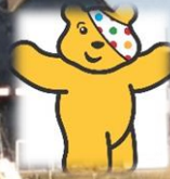
RAISING MONEY FOR CHILDREN IN NEED