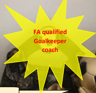
FA qualified Goalkeeper coach